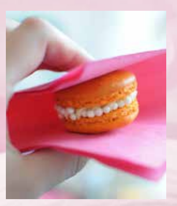
"For beautiful eyes, look for the good in others; for beautiful lips, speak only words of kindness; and for poise, walk with the knowledge that you are never alone." — Audrey Hepburn —